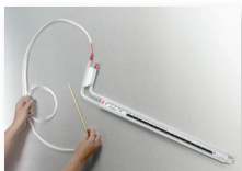
1227 mounted in incline position